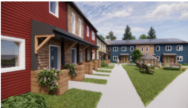
Passive Design Solutions rendering Queens Neighbourhood Co-operative Housing Liverpool, Nova Scotia

QNCH received CHDP support and funding. The views expressed here are the personal views of the author and CMHC accepts no responsibility for them.